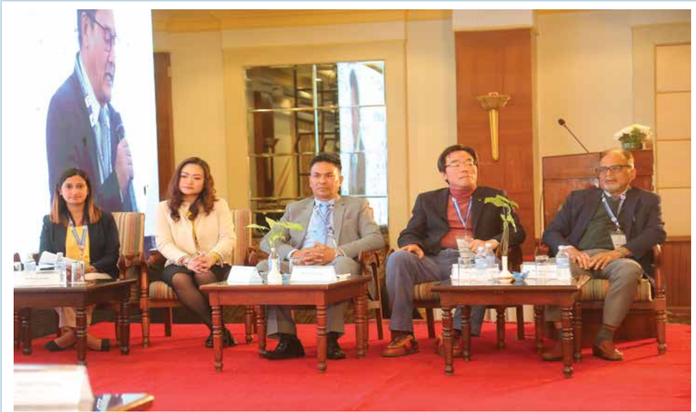
Presentors for the session