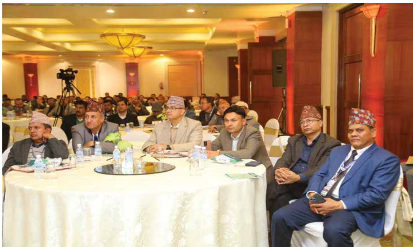
Forever attentive and curious listeners