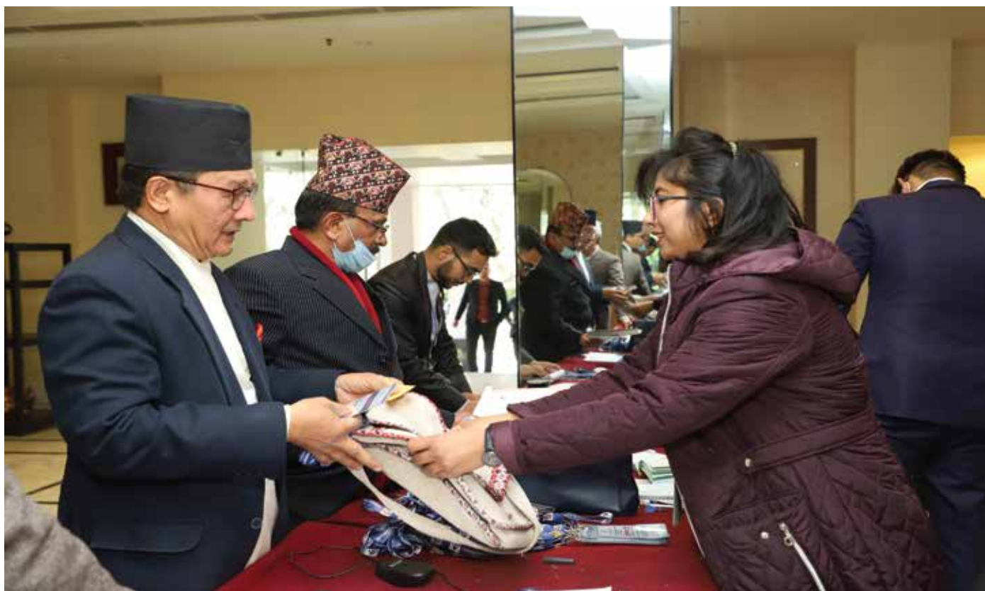
Arrival and Registration of Participants