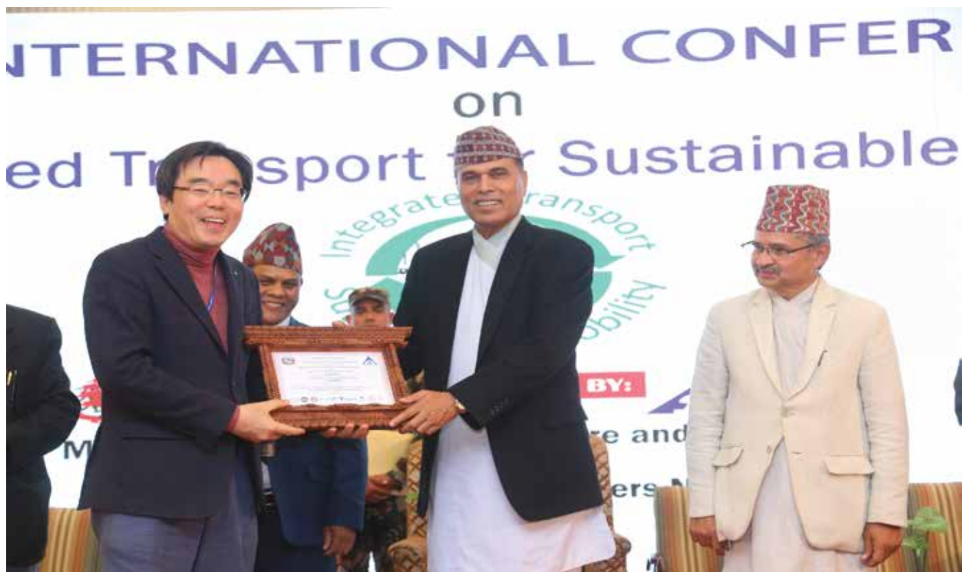
Token of Appreciation to the guests and supporting Institutions by Hon. Minister, MoUD, Mr. Bikram Pandey