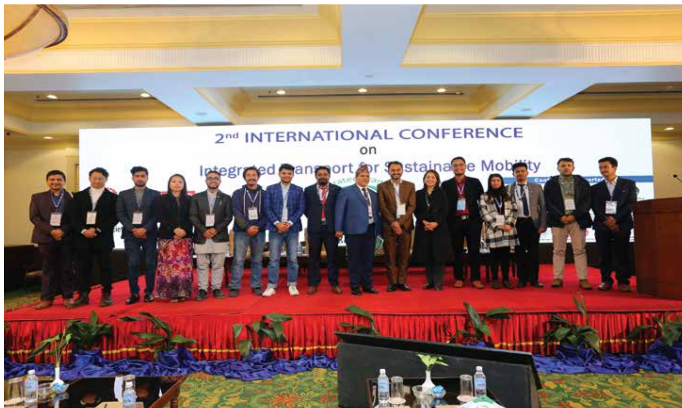
The Organizers and the Volunteers