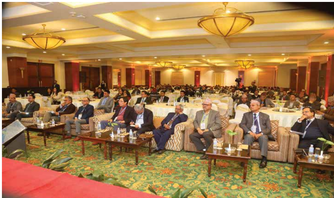
The official beginnig of the grand closing session