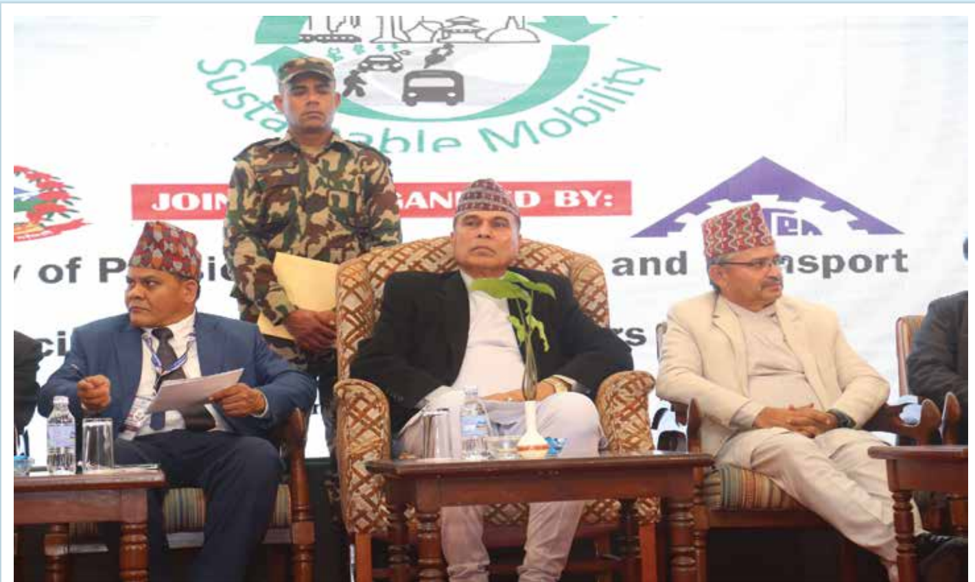
Honourable Minister on dais with the dignitaries