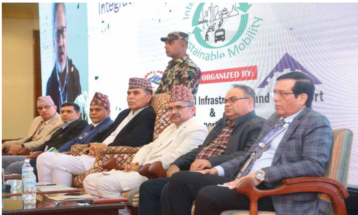
Dignitaries on the dias