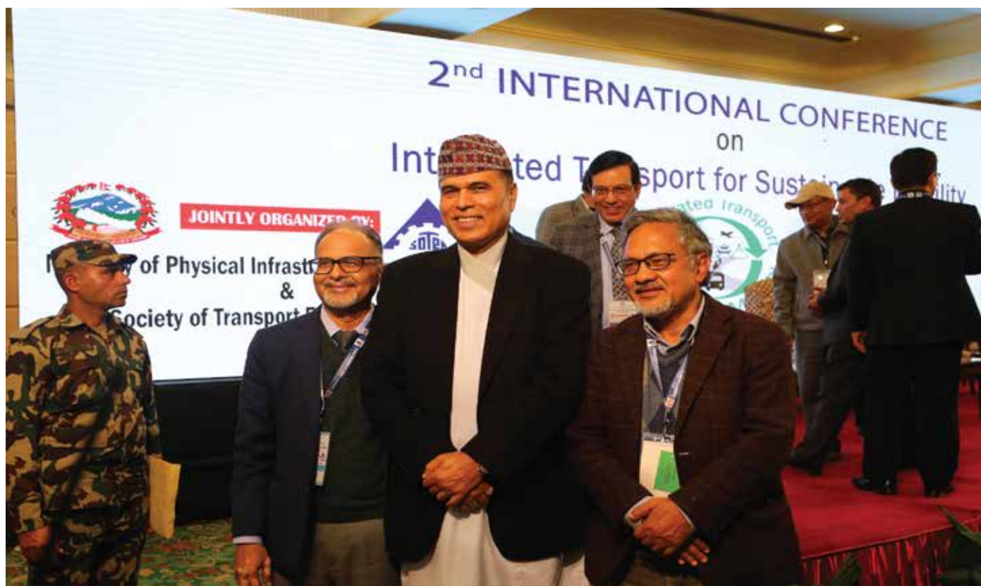
Thank you to the chief guest for accepting the invitation