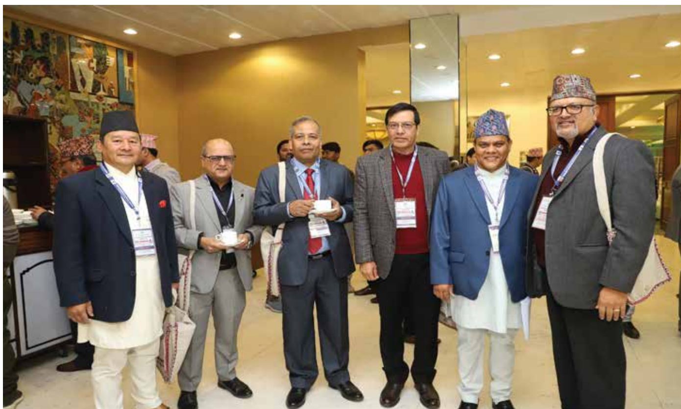
Tea/ Coffee, Cookies and interactions