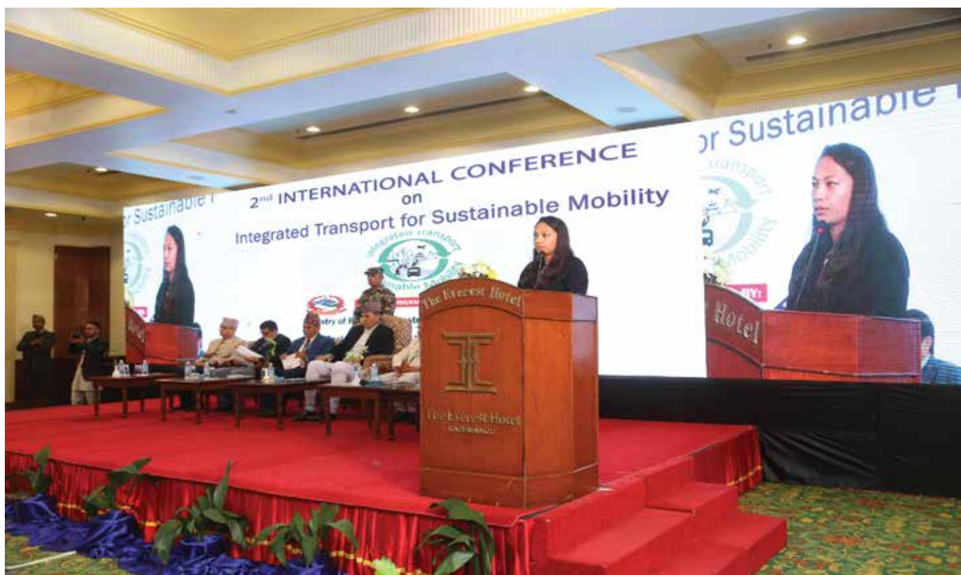
Ready for the grand closing of the conference