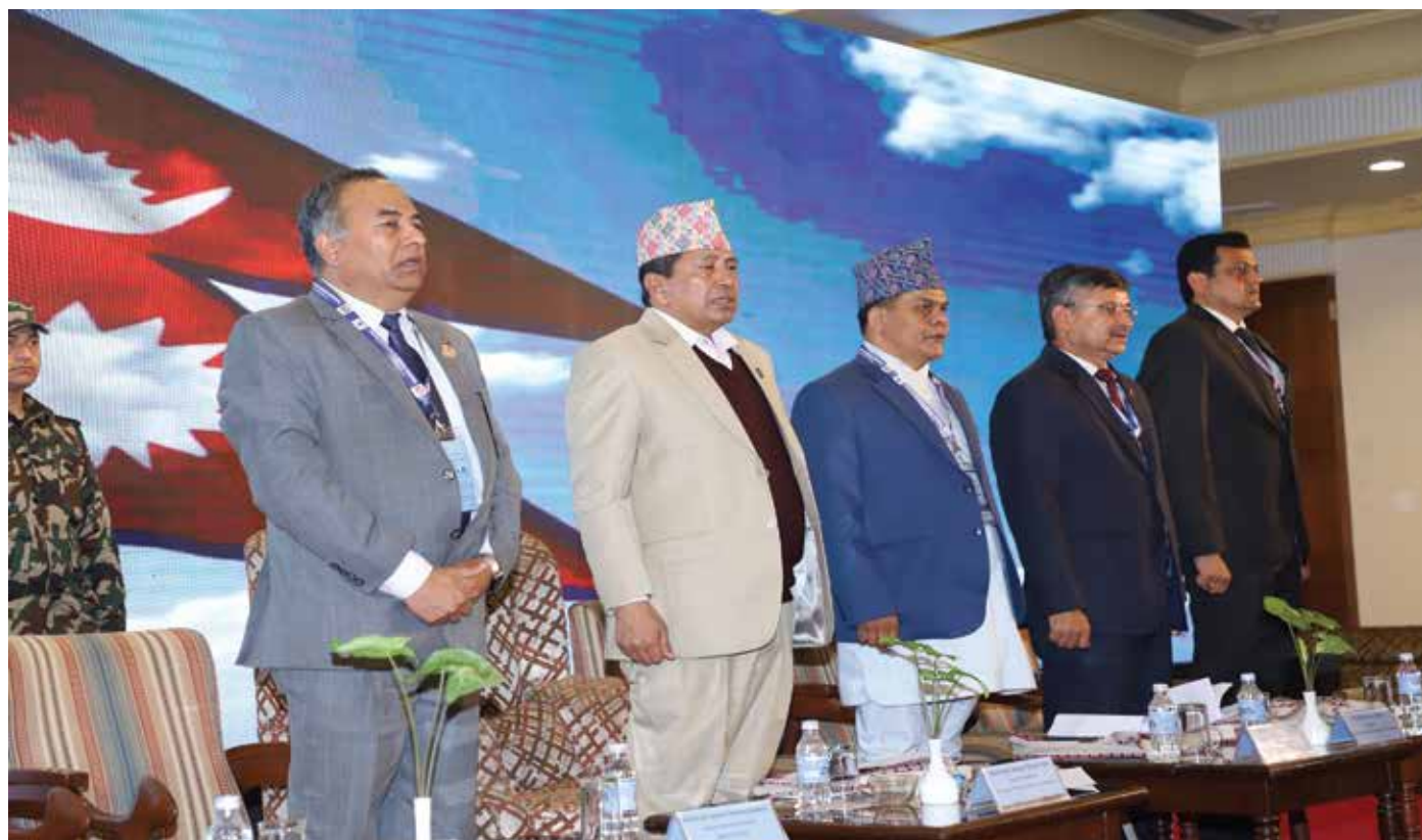
Standing up for the National Anthem