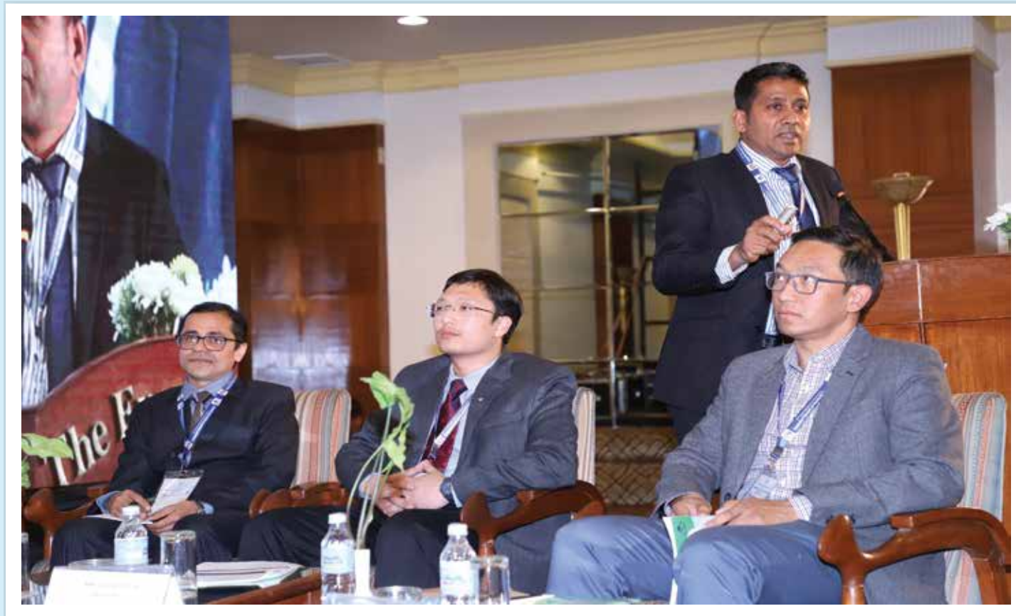
Presenters of the session