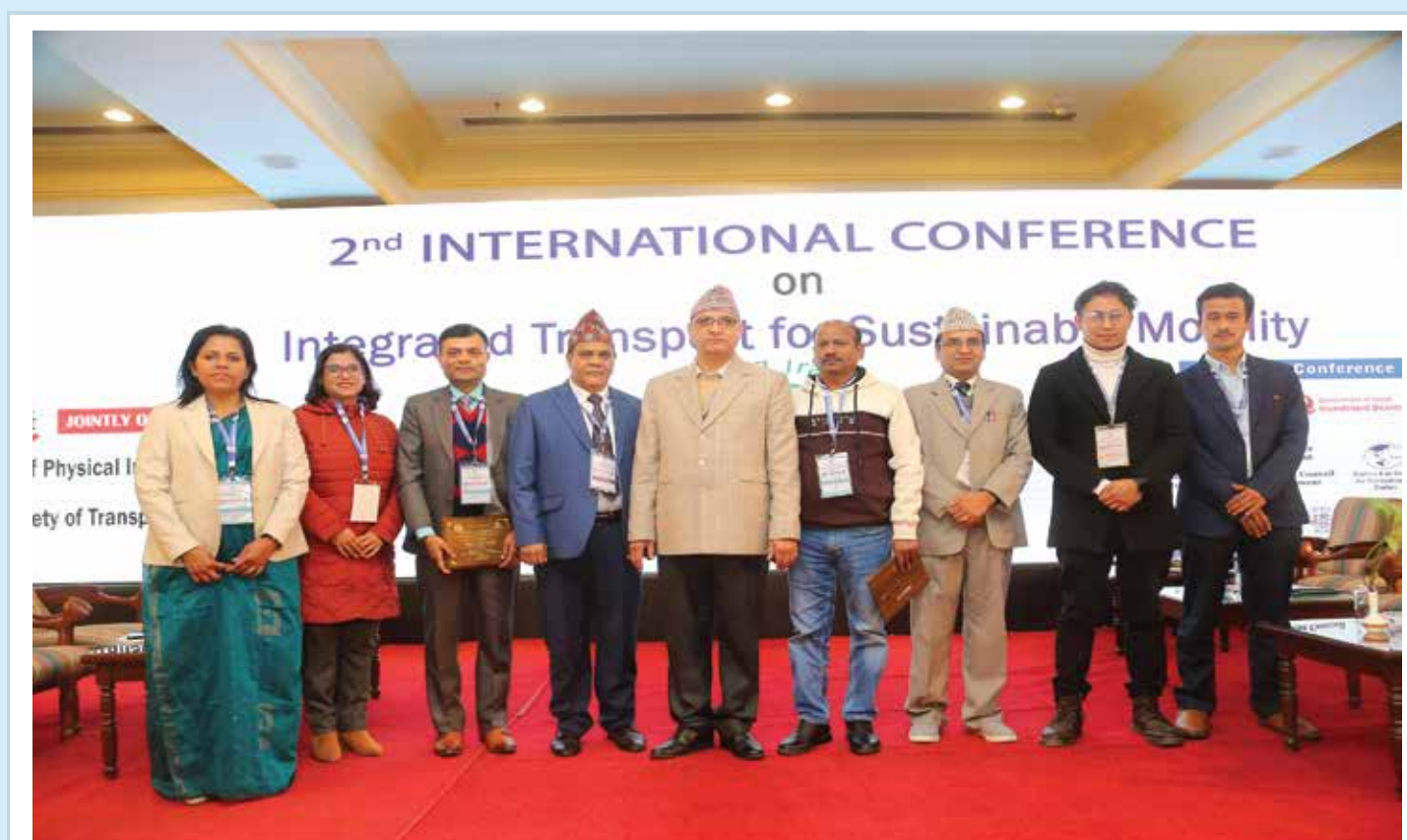
A delightful group photo