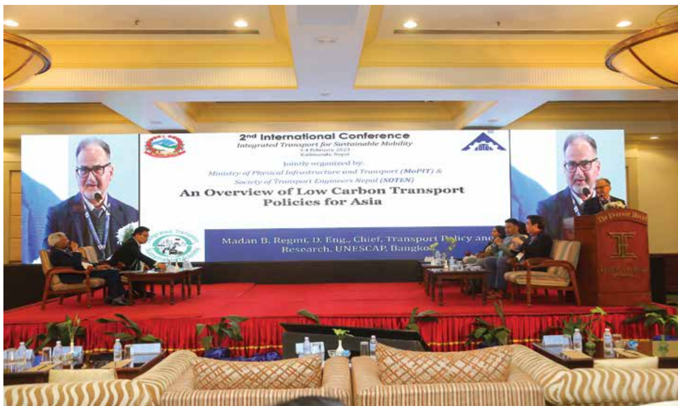
"An Overview of Low Carbon Transport Policies for Asia"