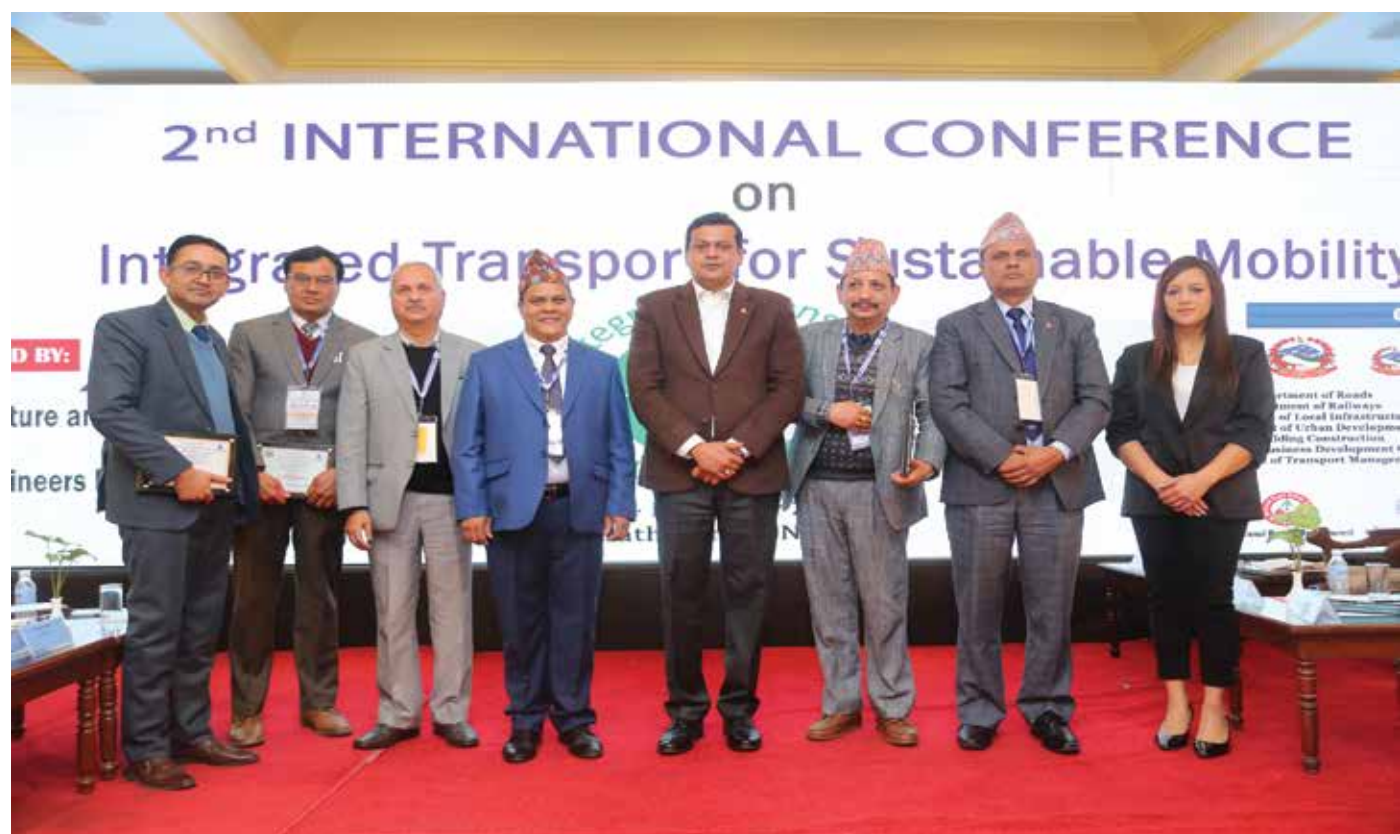
A group photo