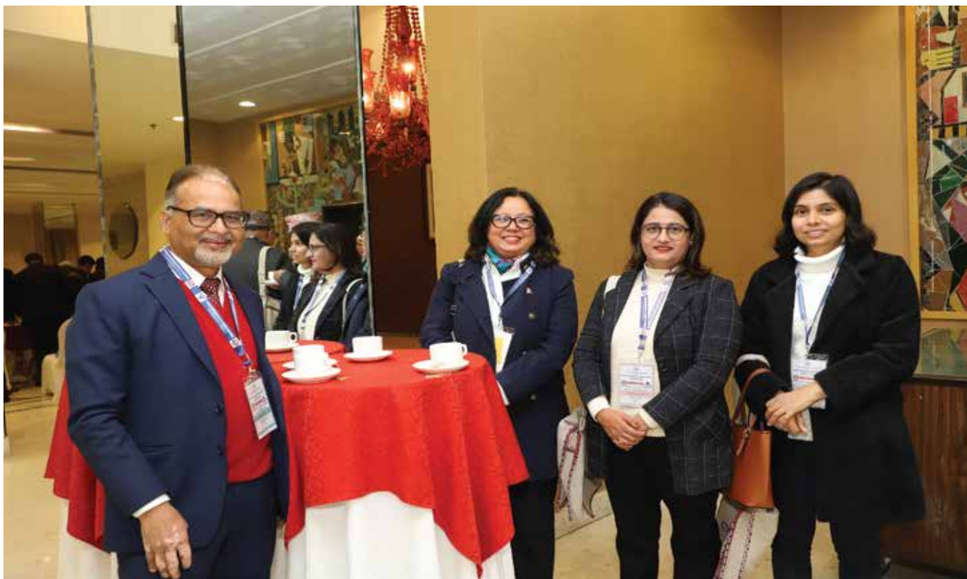
Tea/ Coffee, Cookies and interactions