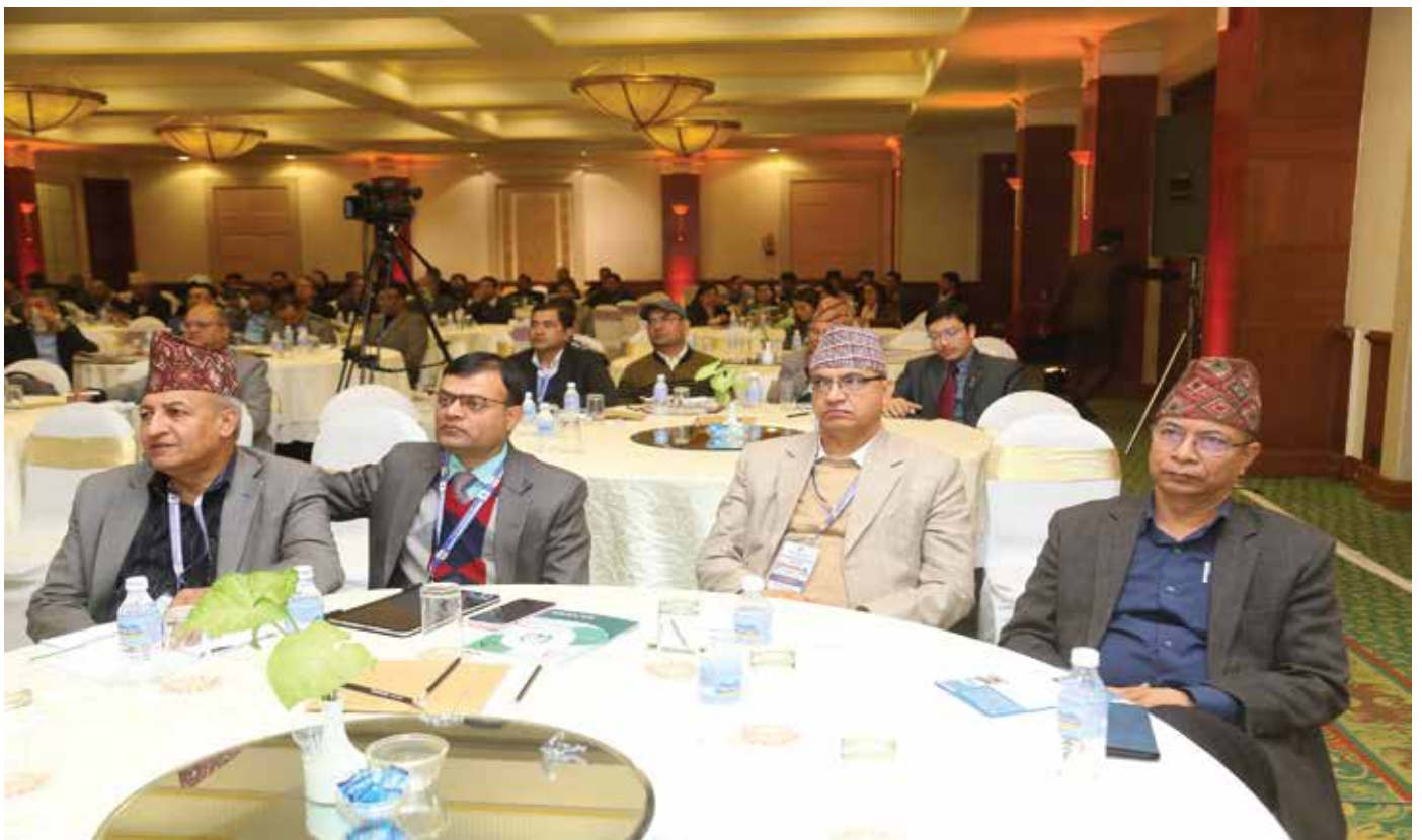
Active participataion from all