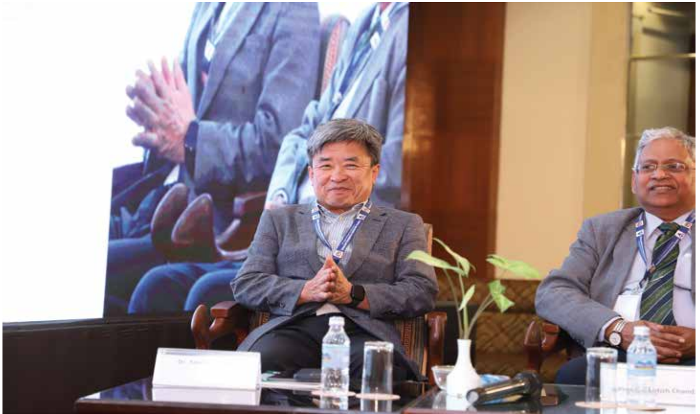
Paper presenters of the session