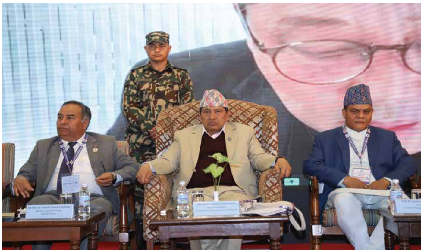
President, SOTEN with Chief Guest and Key-note Speaker of the Conference