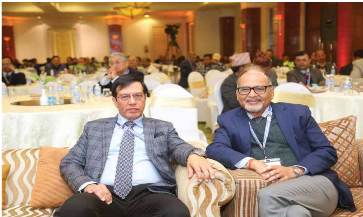
Guests on front row