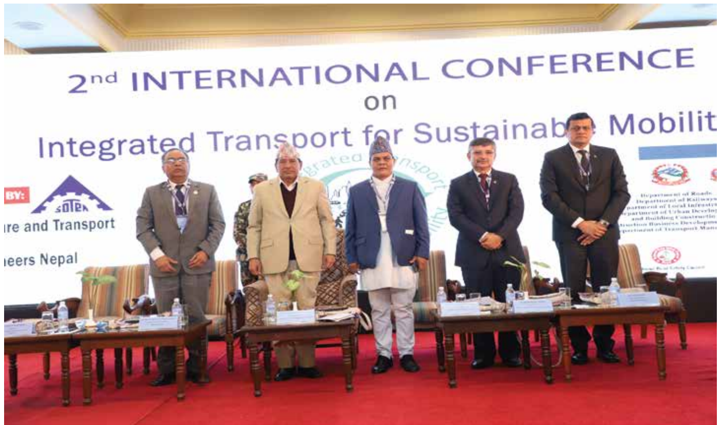
Photo session of dignitaries on the dais