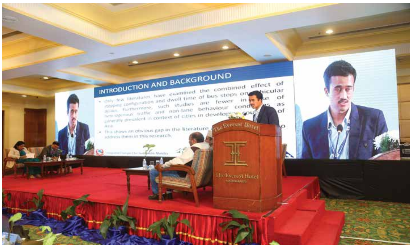
'Modelling Delay due to Curb-Side Bus Stops at Signalized Intersection: A case study fo New Bane-shwor Intersection' by Amul Shrestha, et. al.