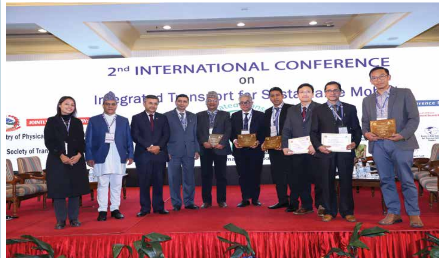
A wolesome group photo of the session