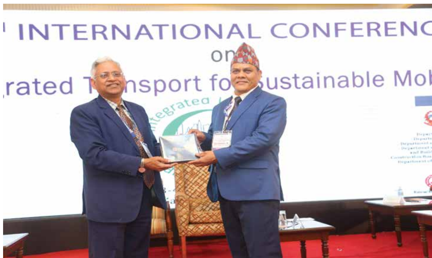
A token of love from IIT Roorkee to SOTEN President