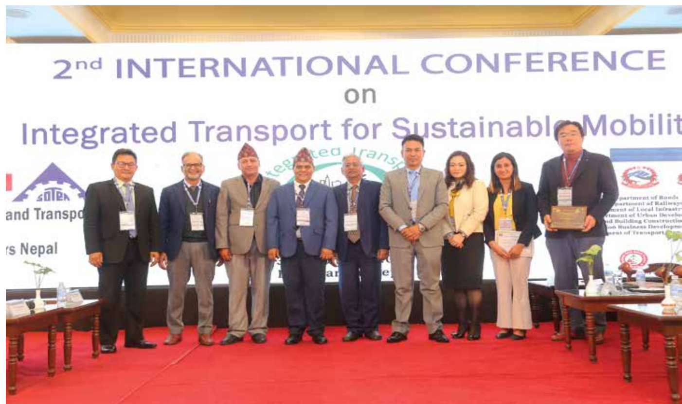
A memorable group photo