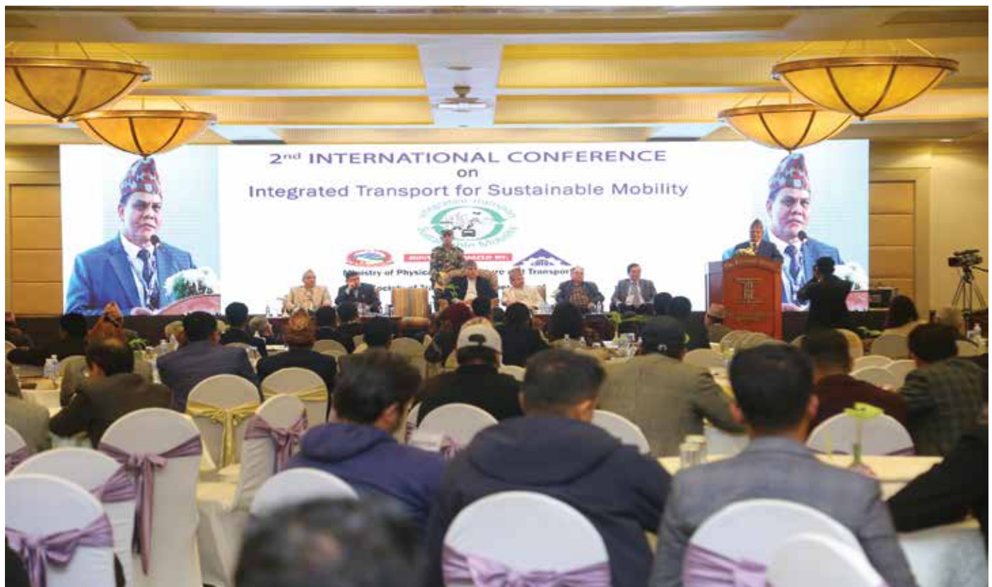
The closing remarks