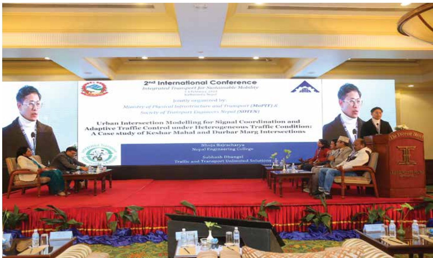
'Urban Intersection Modelling for Signal coordination and Adaptive Traffic Control under Heterogeneous Traffic Condition' - Nhuja Bajracharya, et. al.