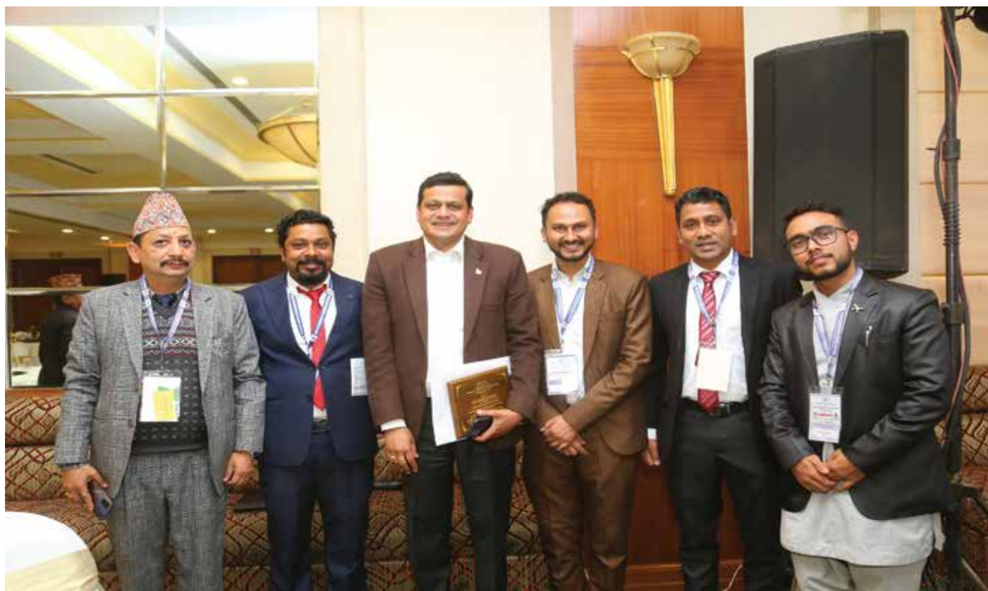
A group photo at the lunch break