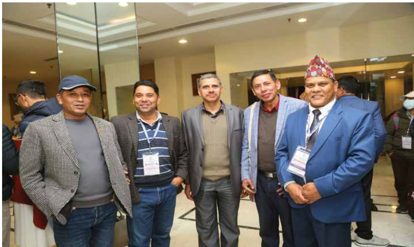
A click during the lunch and interaction session