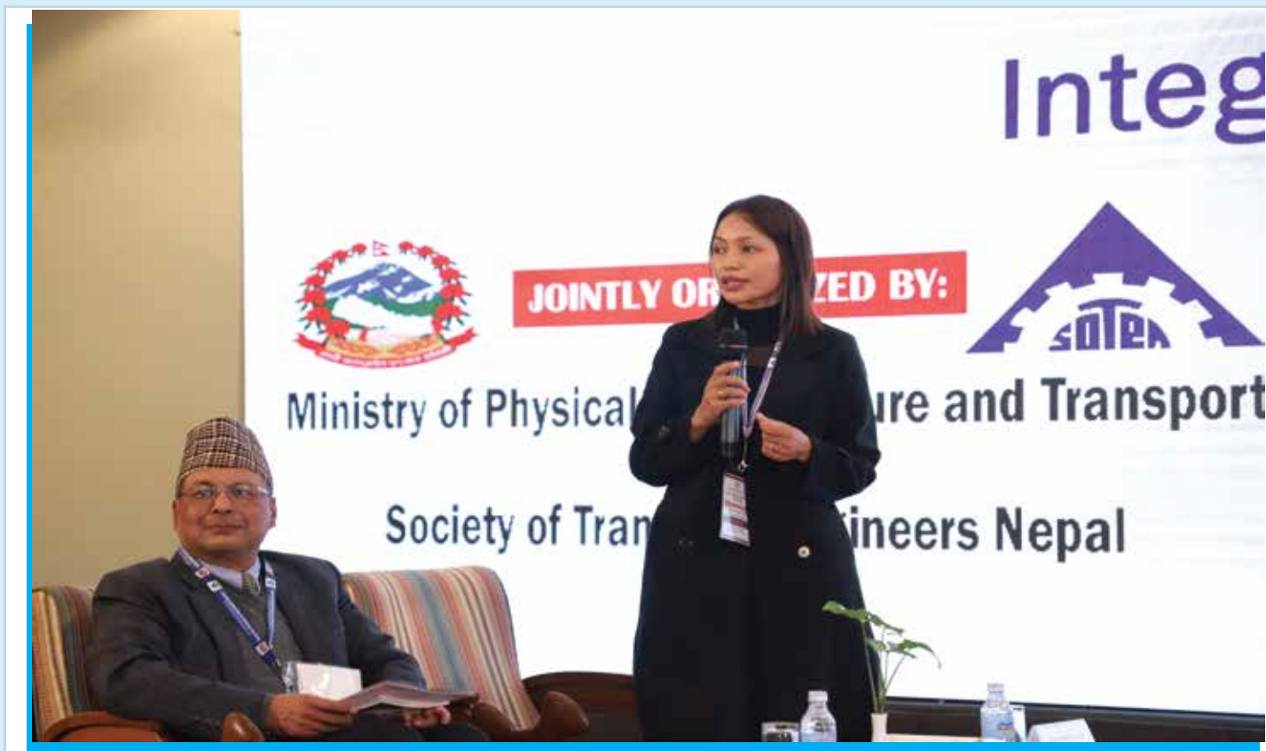
Session Chair and moderator