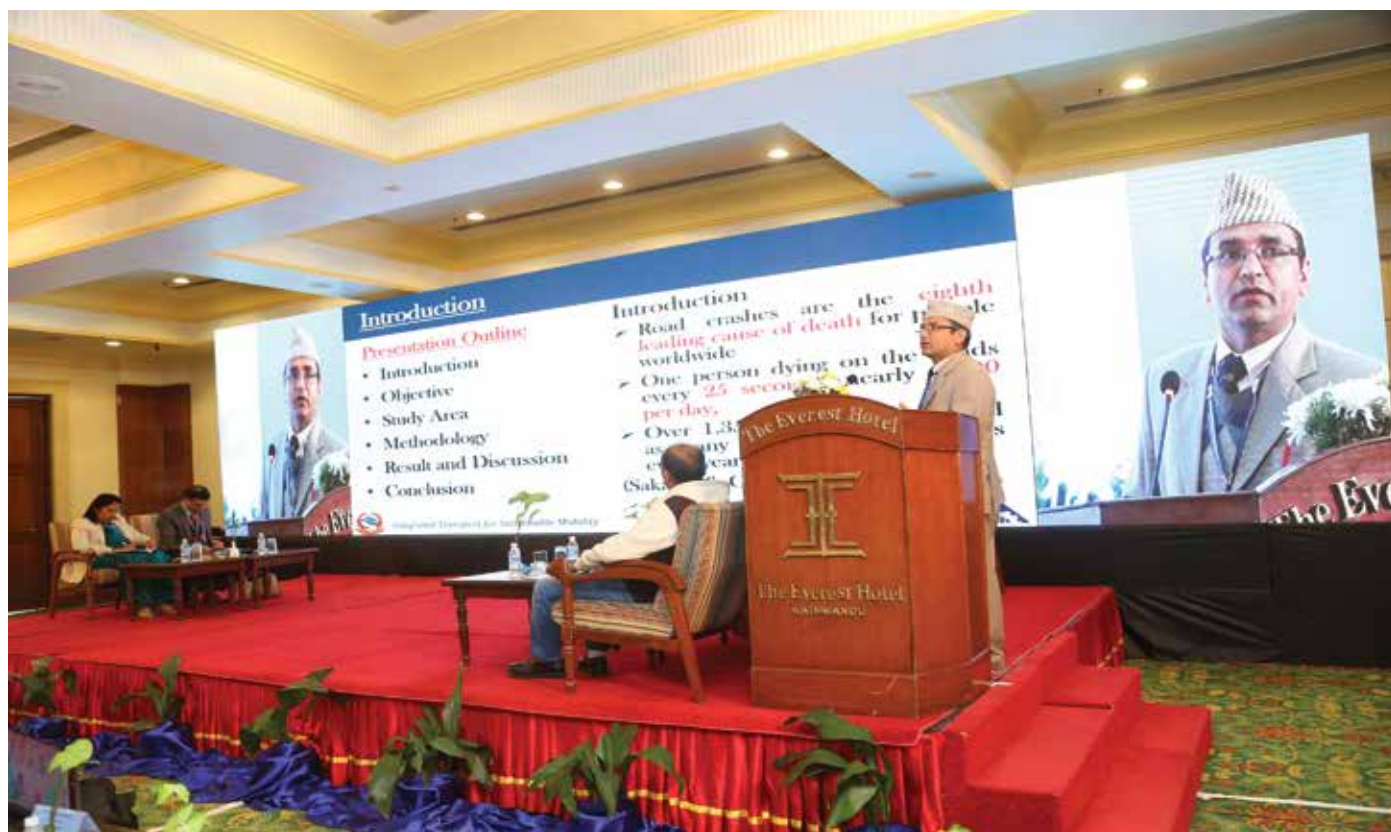
'Safety evaluation of National Highway using International Road Assessment Programme: A case study of NH14' –Mohan Dhoja K.C., et. al.