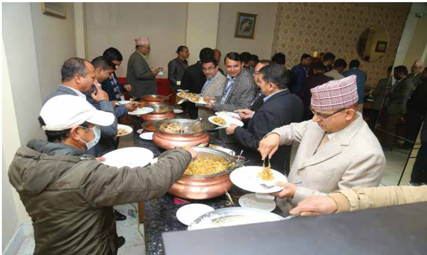
What's on the plate?