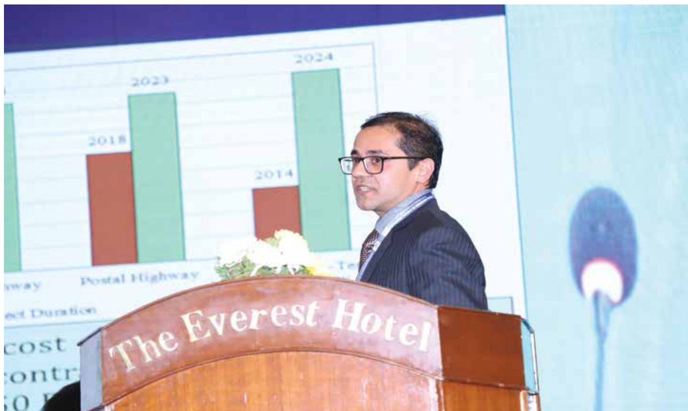
Role of financing institutions in the time and cost performance management of road infrastructure construction in Nepal' by Chhabi Lal Paudel, et. al.