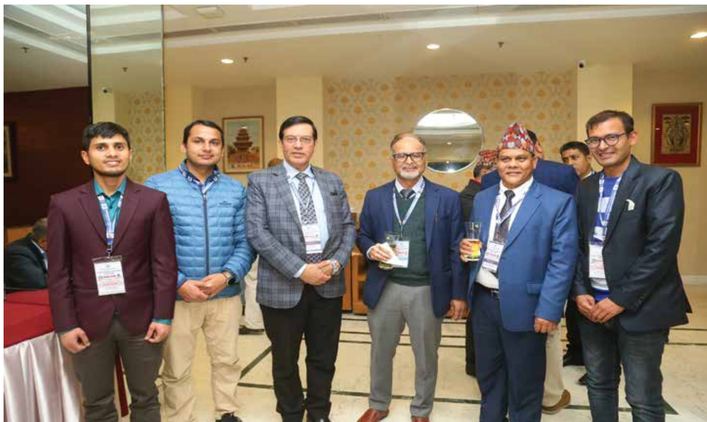
A click during the lunch and interaction session