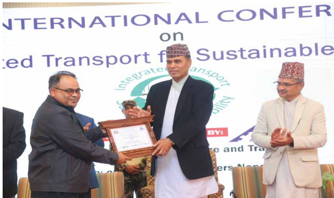
Token of Appreciation to the guests and supporting Institutions by Hon. Minister, MoUD, Mr. Bikram Pandey