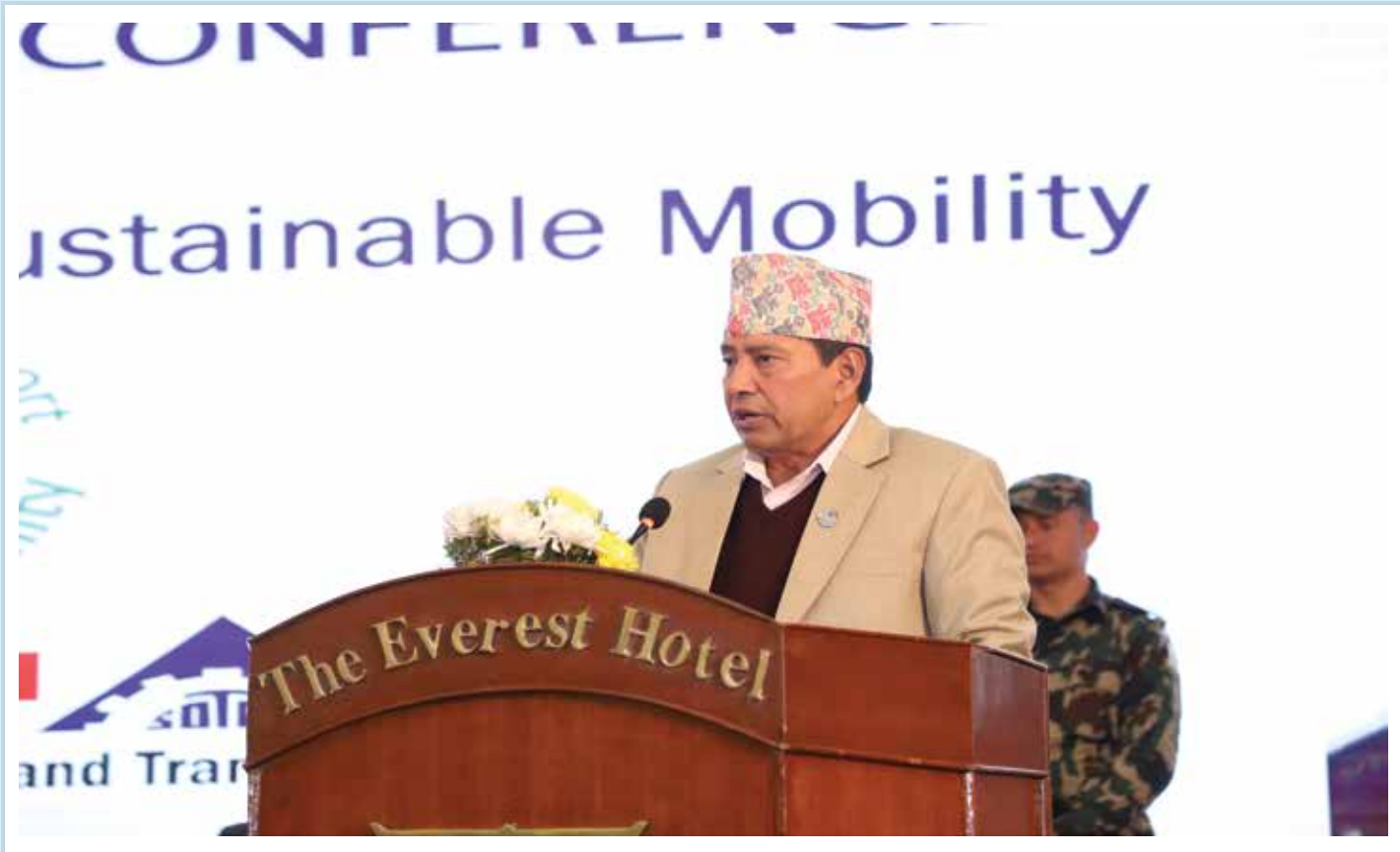
Opening Remarks by the Chief Guest