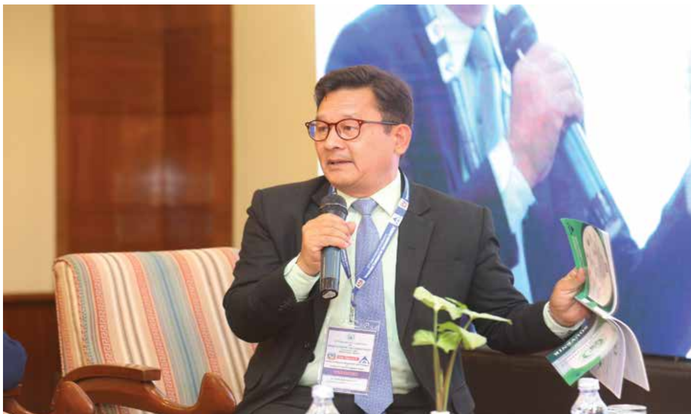
Inviting the next presentation