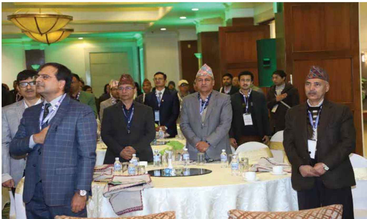
Standing up for the National Anthem