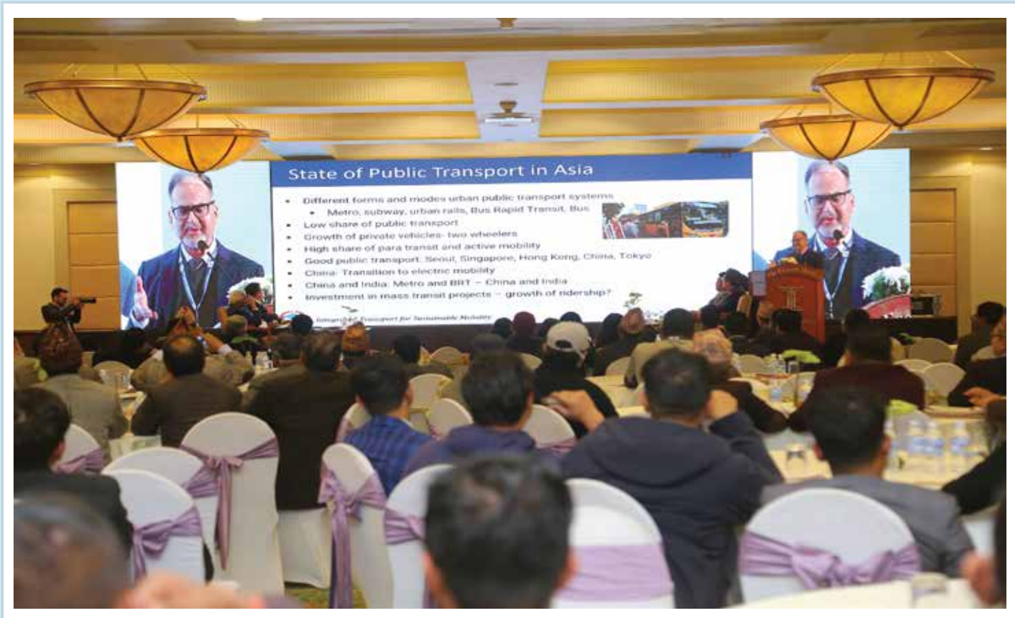
A warm presence of participants