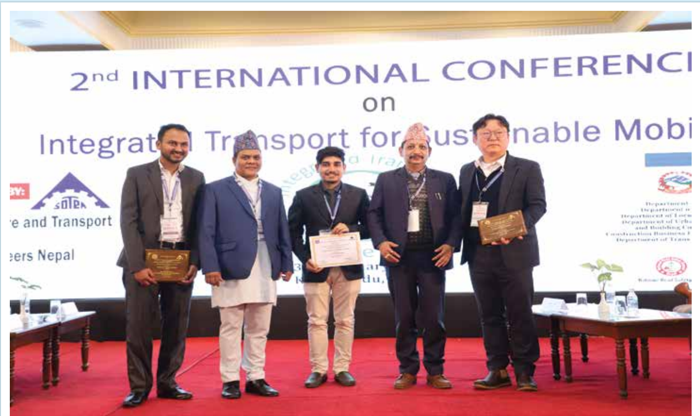
Group photo session