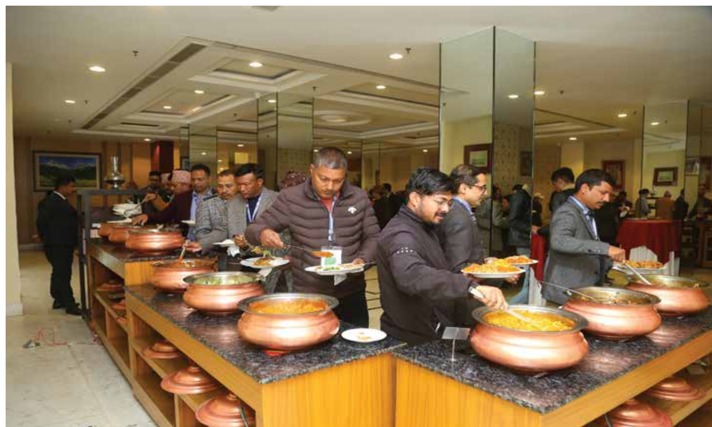
Good food for good health at lunch break