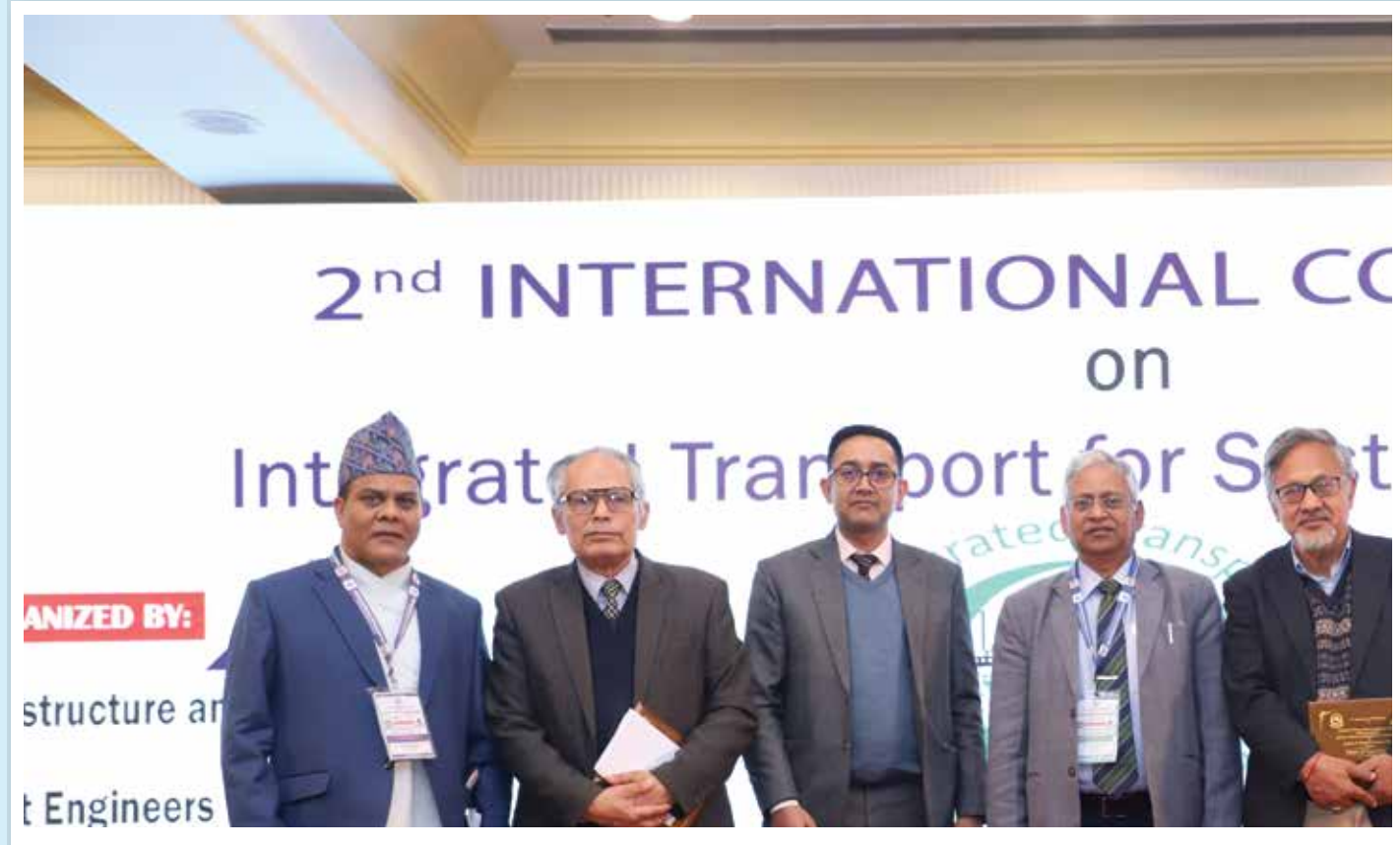
Group Photo Session