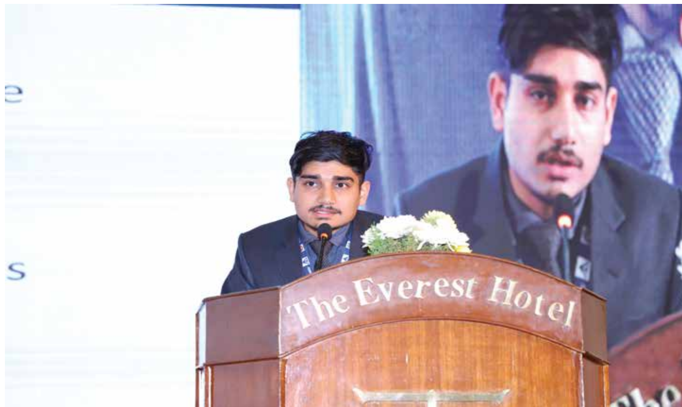
'Comparative analysis of different non-rigid crash barriers: a case study of Nepal' by Ayush Man Karki, et. al., IOE Pulchowk Campus