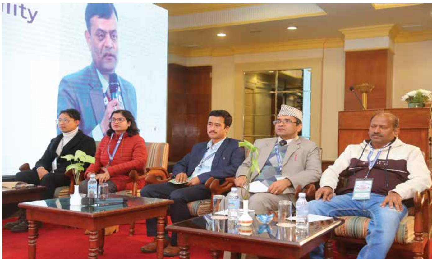
Presentors for the session