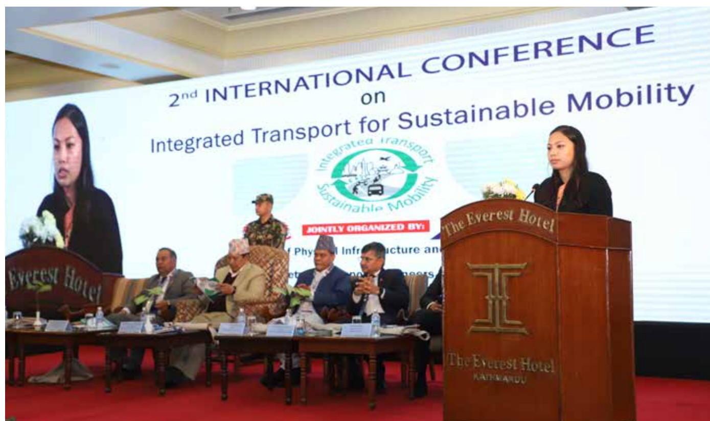
Host inviting the dignitaries to the dais and guests to the front row