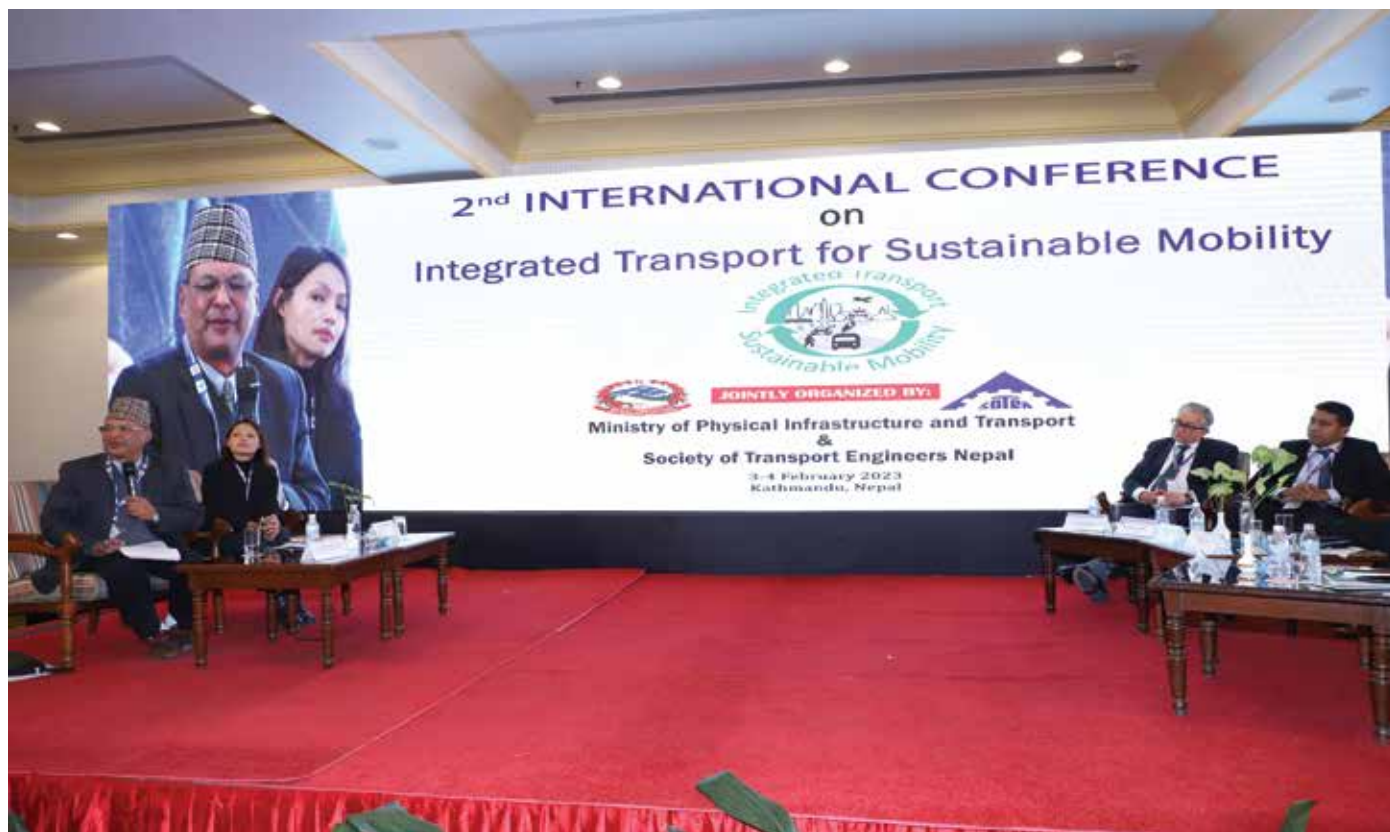
Session is almost about to end with success