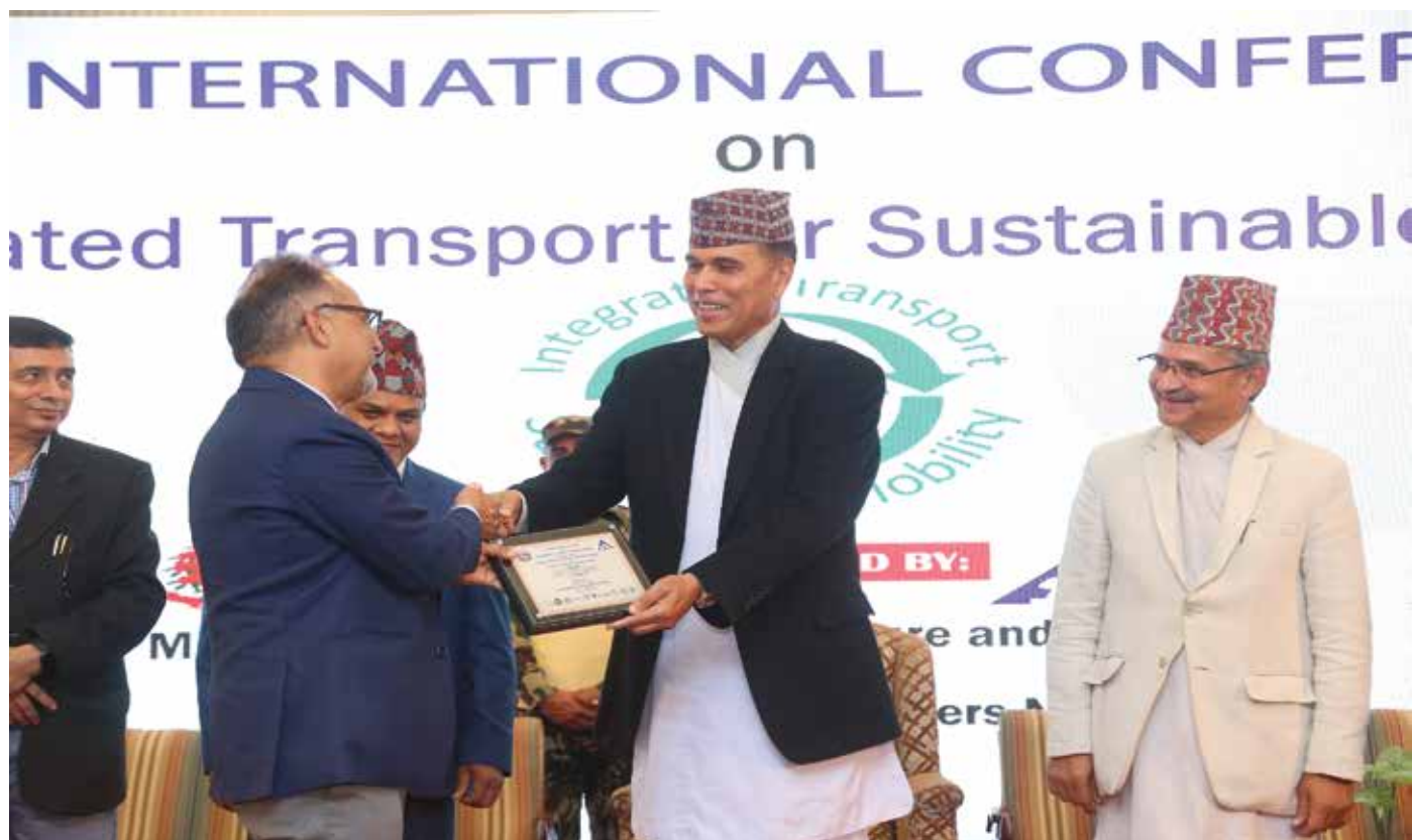
Token of Appreciation to the guests and supporting Institutions by Hon. Minister, MoUD, Mr. Bikram Pandey