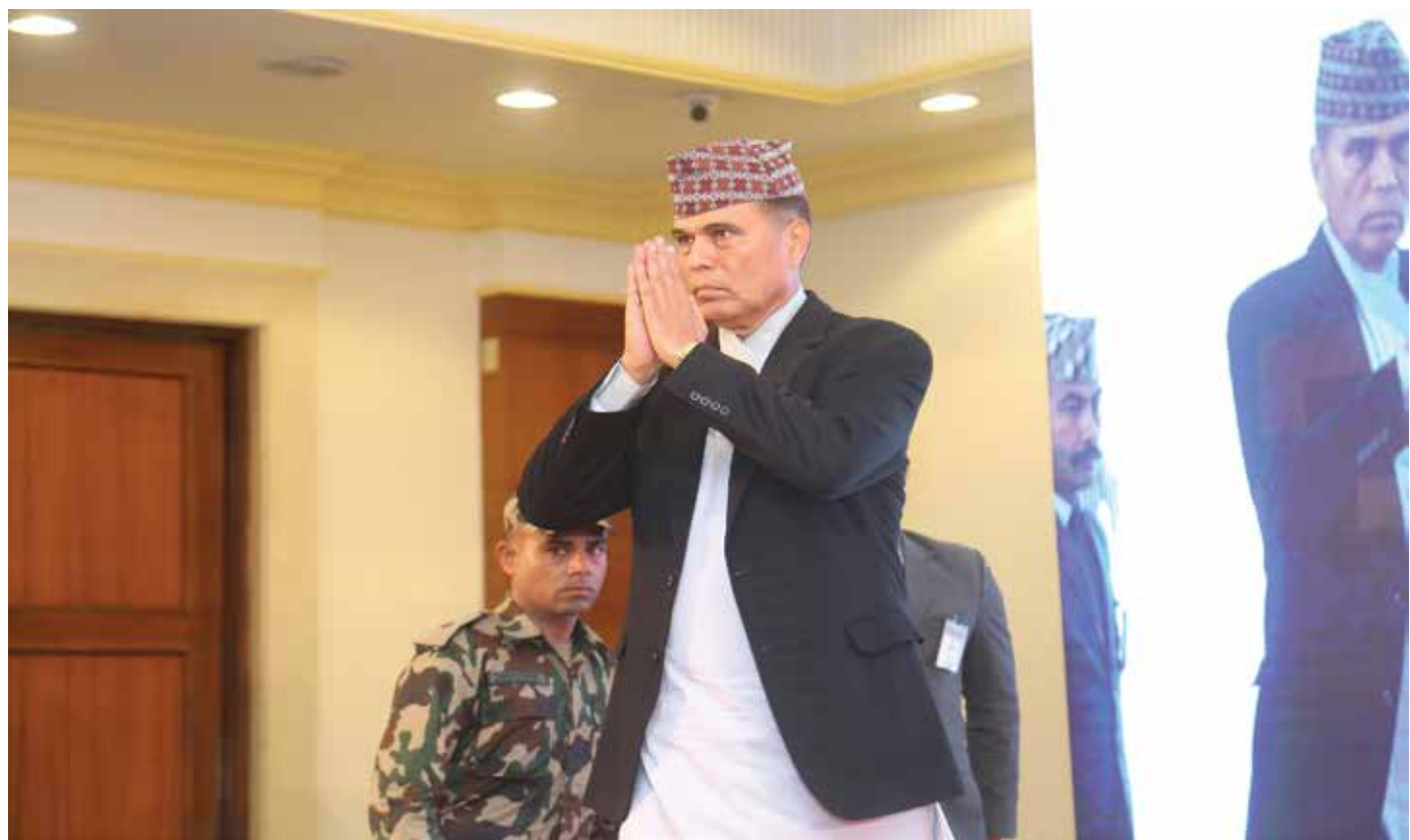
Chief Guest: Honourable Minister, Ministry of Urban Development,