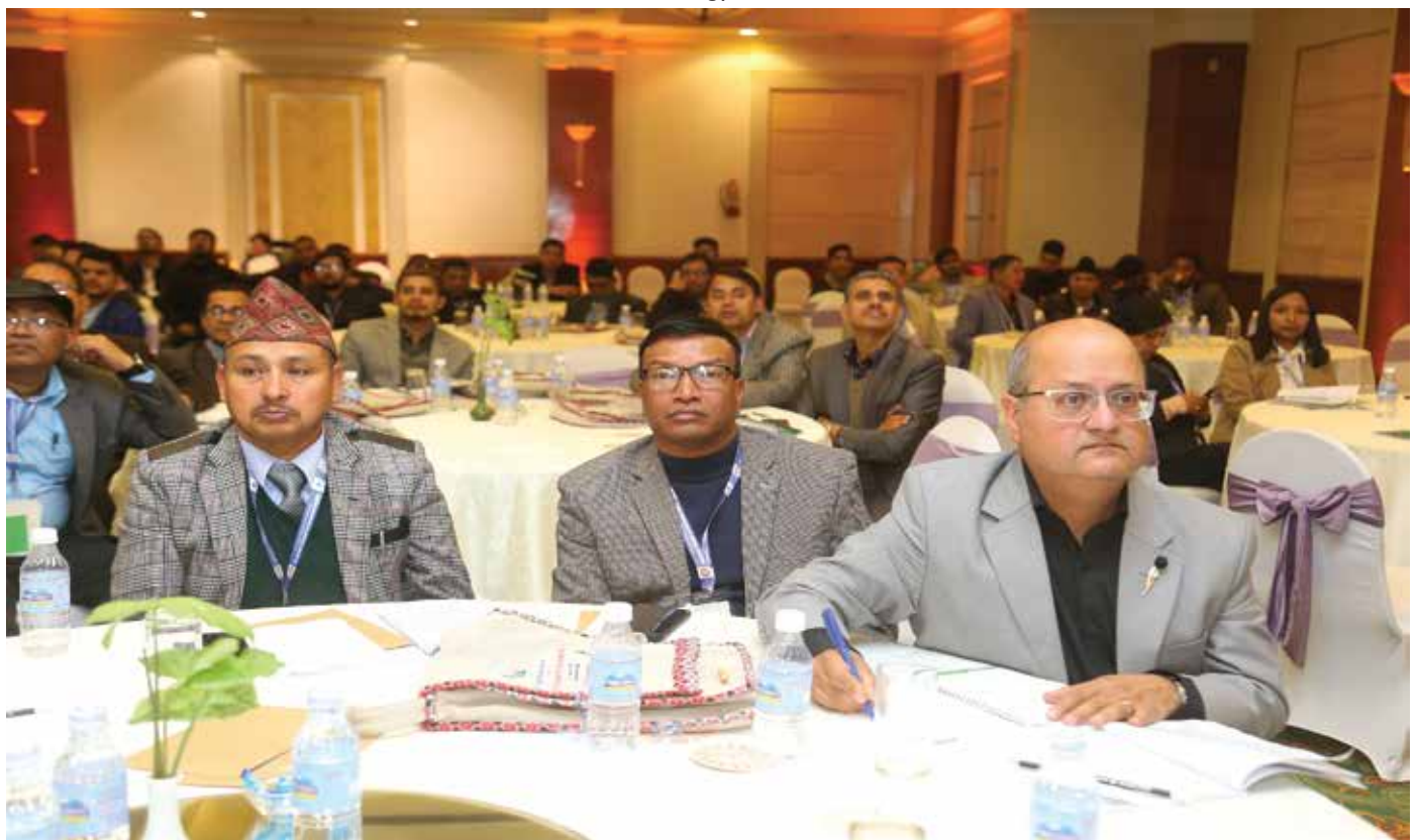
Keen interest from the listeners