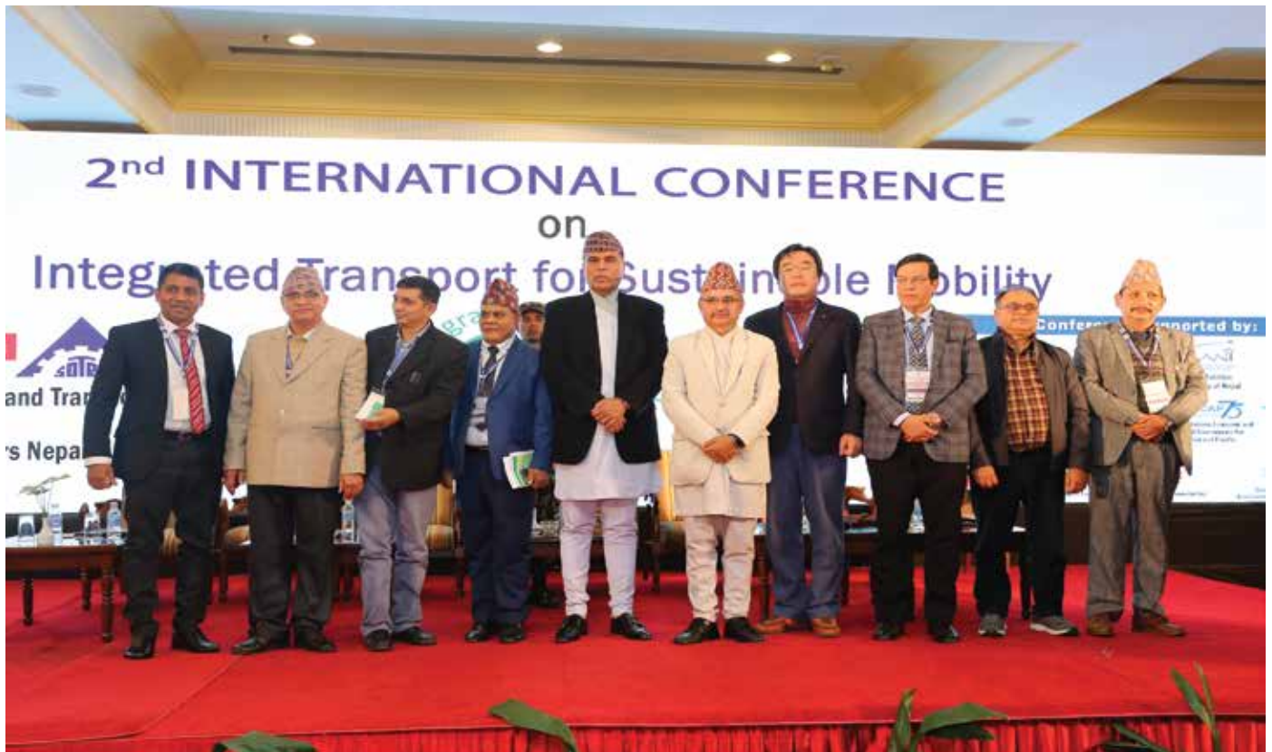
A photo with all the guests, dignitaries, and chief guests