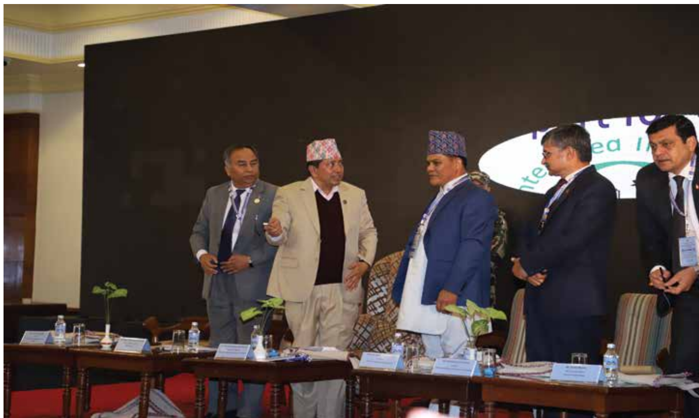
Digital inauguration by Chief guest