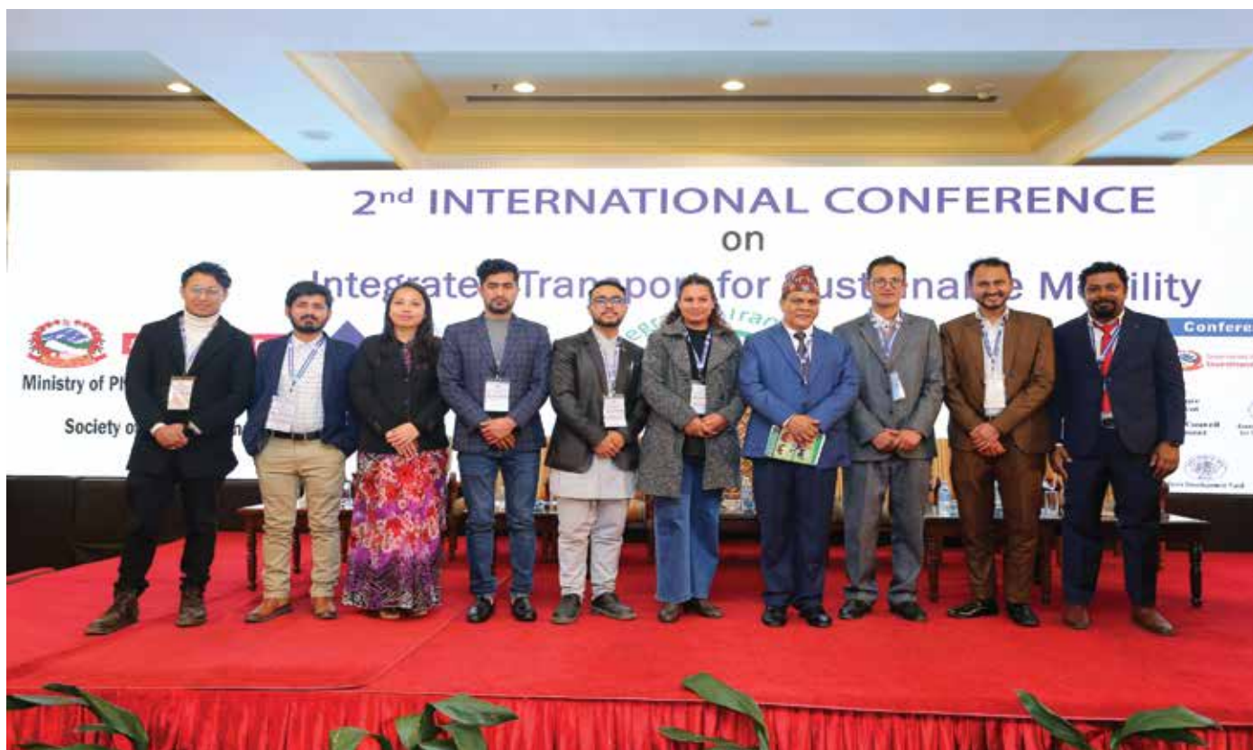
A picture at the end