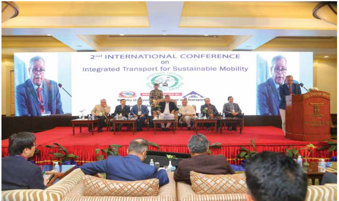
Almost at the successful end of the grant program