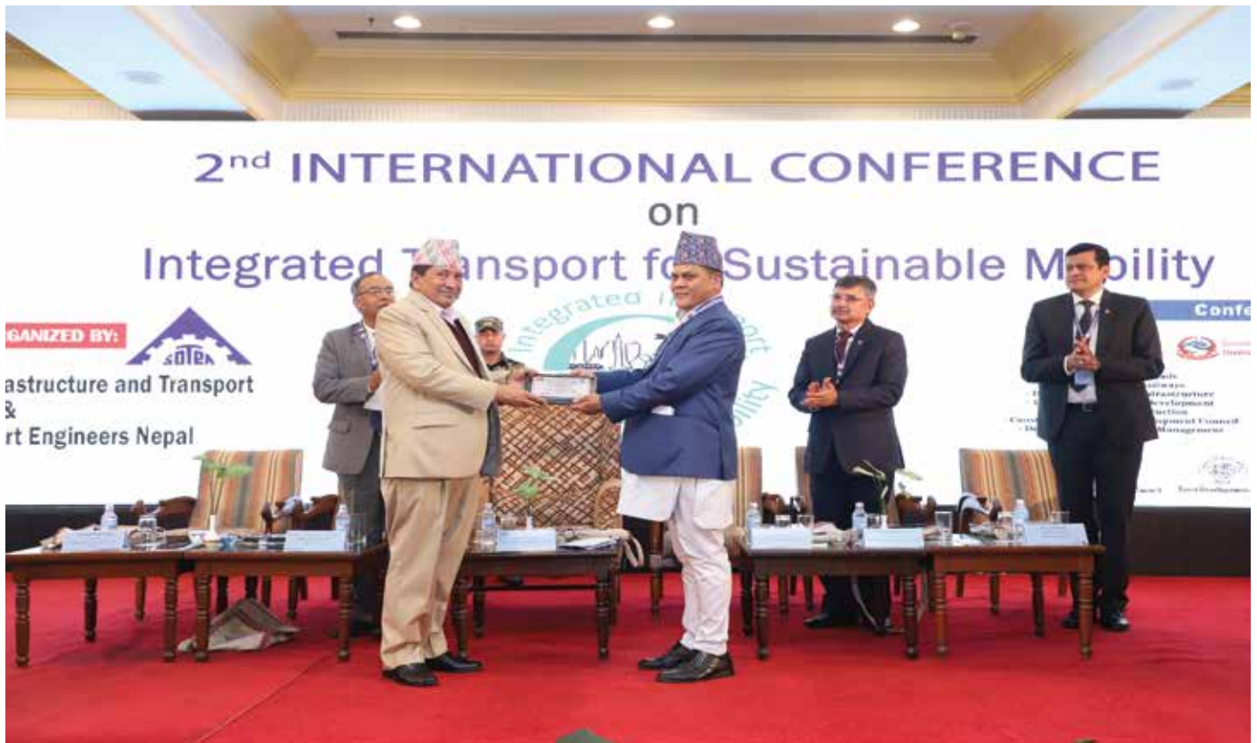
A token of Appreciation to Chif Guest